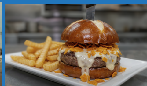
Stuffed Doritos Burger