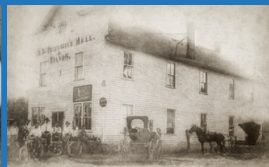
Pelegrin's Hall & Saloon on Lineville Rd, c. 1885