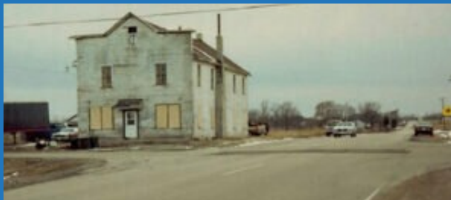
The late Town Line Tavern on Lineville Rd.